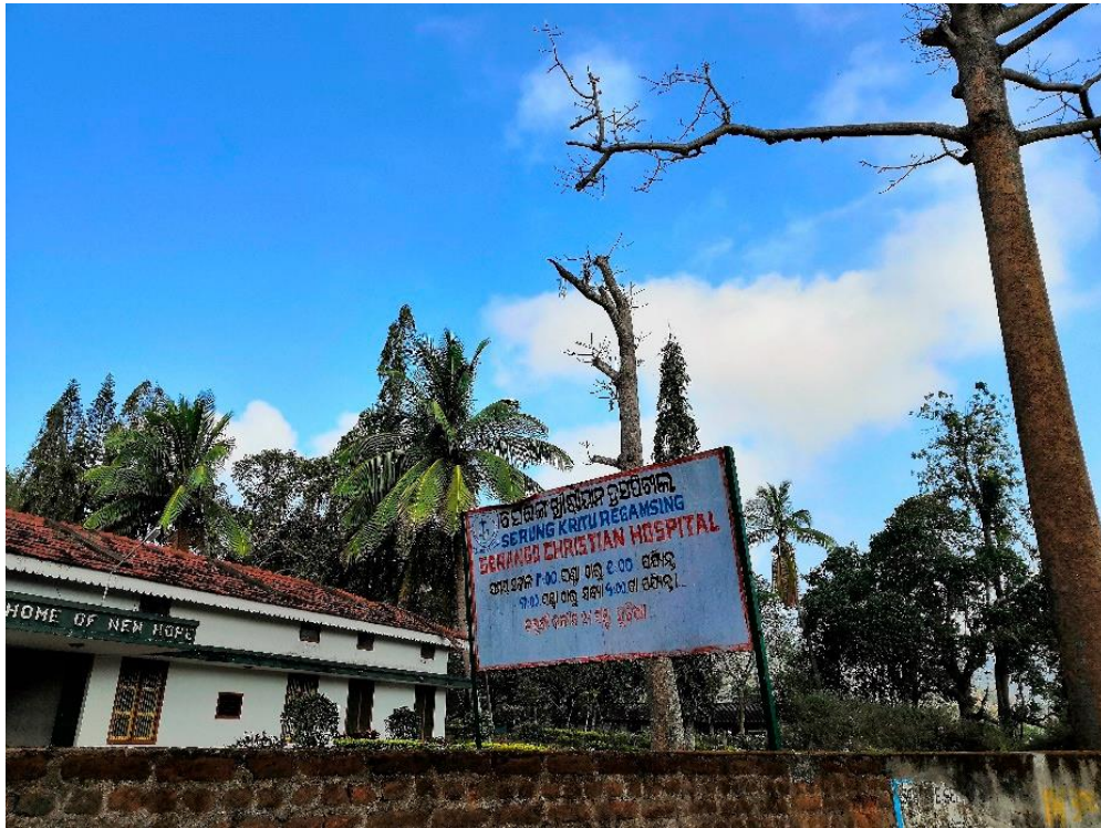
Figure 3. Source: the Serango Christian Hospital in Ganjam district (now under the Gajapati district) established by the Canadian Baptist Mission ( https://upload.wikimedia.org/wikipedia/commons/5/58/SCH%2C_Serango.jpg , accessed on 2 March 2021)

for more than three months, finally turned up to the hospital and he was diagnosed with an abscess of liver. After proper treatment, within ten days, he recuperated from his illness, and became a staunch believer in medicines, rather than making an offering to the demons for keeping away diseases. Another Savara patient, who was a well-off local landowner suffered from swollen thighs and hips. He did not get any respite after performing animal sacrifices, and finally came to the hospital after being persuaded by some of the Oriya Christian converts. He was also diagnosed with a severe abscess. However, after applying simple incision and drainage, it gave him immediate relief. All this news spread in the localities and a number of people came to the hospital for treatment. They started seeing the hospital as a place where both prayers and cures were part of life [69] (pp. 5–7), [70]. These incidents showed how reliance on spirit worship shifted to the Holy Spirit.